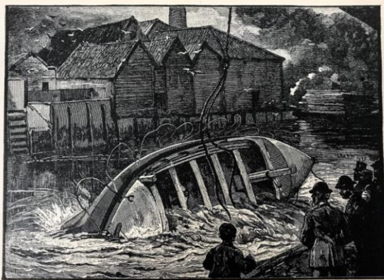
TESTING SELF-RIGHTING BOAT.

Despite its auspicious beginnings in 1824 when it raised £10,000 in its first year, by 1849 the Royal National Lifeboat Institution (RNLI) had an income of just £354 and less than 20 lifeboats, many of which were literally rotting away around the coast. By 1897, however, the RNLI had almost 300 well maintained lifeboats encircling Britain and Ireland and an annual income of £60,000. With the RNLI on the cusp of its bicentenary in 2024, this seminar will explore this pivotal period in the charity's organisational development through the prism of two events: the RNLI's receipt of a government subsidy between 1854 and 1869 and a Parliamentary inquiry into its management and operations in 1897, neither of which have received significant attention in either the RNLI's own historiography or the wider literature on nineteenth century charity and philanthropy and maritime safety reform.